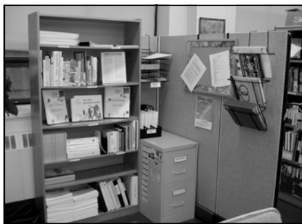
A new selection of parent resources for early childhood practitioners that is available in the resource centre.

At St. Joseph's College of Early Childhood Education, we provide an opportunity for students to study and gain experience in Early Childhood Education through a diverse range of courses and practical settings.