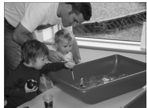
Visitors enjoy the Mawio'mi Family Fun Day as families gather together to celebrate the Grand Opening of the centre.