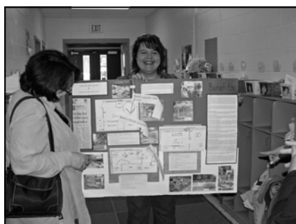
Members of the Leading Edge Discussion Group share strategies.

At St. Joseph's College of Early Childhood Education, we provide an opportunity for students to study and gain experience in Early Childhood Education through a diverse range of courses and practical settings.