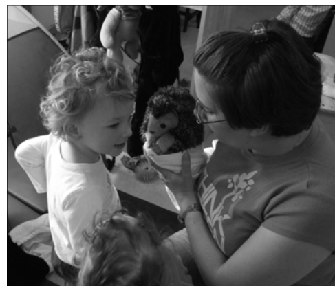
Nymphadora visits the toddler room.

This experience reminded me that bringing your own interests into the classroom can